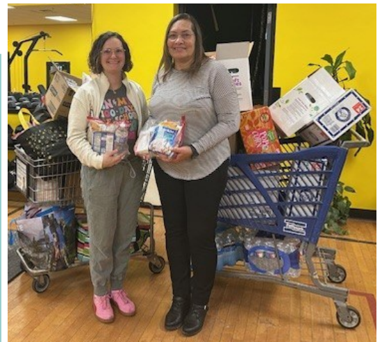
Pictured: Collegium Charter School in Exton donated food and household items to support our families in need.

CAADC has been fortunate to receive the following private contributions from the community during the last quarter: The Ethel Sergeant Clark Smith Memorial Fund provided a grant of $7,000 for Veterans Outreach Support. CAADC received a contribution of $30,000 from WSFS Bank for the Neighborhood Assistance Program. The Charities Aid Foundation of America donated $640 to the Agency to support our programs. The United Way of Greater Philadelphia and Southern NJ contributed $940 for Agency support. CAADC received a donation of $620 from First Presbyterian Church of Springfield for the Life Center shelter. CAADC received a donation of $500 from America's Charities . The Hoops from the Heart event in Haverford Township on MLK, Jr. Day raised $3,074 for the Agency. CAADC can also be supported by designating Agency Code #06194 on United Way of Greater Philadelphia and Southern New Jersey forms.